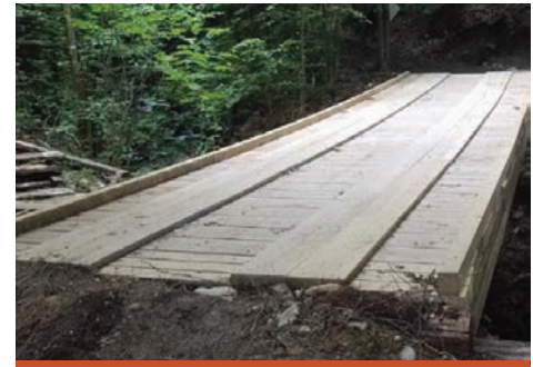
New OHV Bridge in PSF

R epresentatives from the Executive Office of Energy and Environmental Affairs (EOEEA) and the Department of Conservation and Recreation (DCR) have been quietly working on various projects with the Off Highway Vehicle Advisory Committee (OHVAC) to enhance the motorized trail system in Western Massachusetts. These projects, which benefit both OHV riders and snowmobilers, have occurred in Beartown State Forest, Pittsfield State Forest and October Mountain State Forest. They have involved the construction of new bridges, stabilization of trail beds, hazard removal, etc. A few examples are pictured here. 🛹