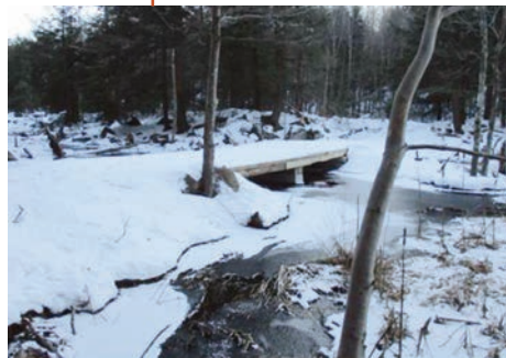
New OHV Bridge in OMSF