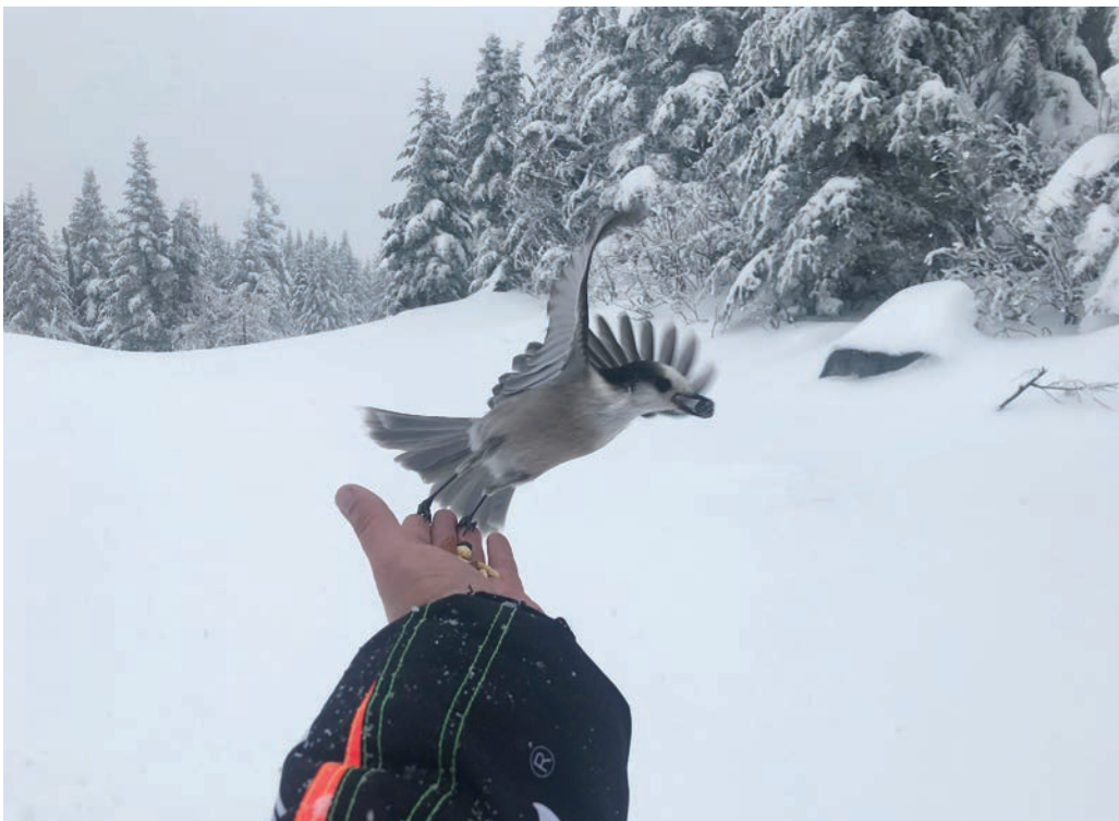
Feeding the Gray Jays.

A new season is upon us. We are actively starting our meetings and will be out clearing trails by the time you are reading this. We are hoping for a great season and we look forward to seeing all of our friends at the Meetings. As always think Snow!