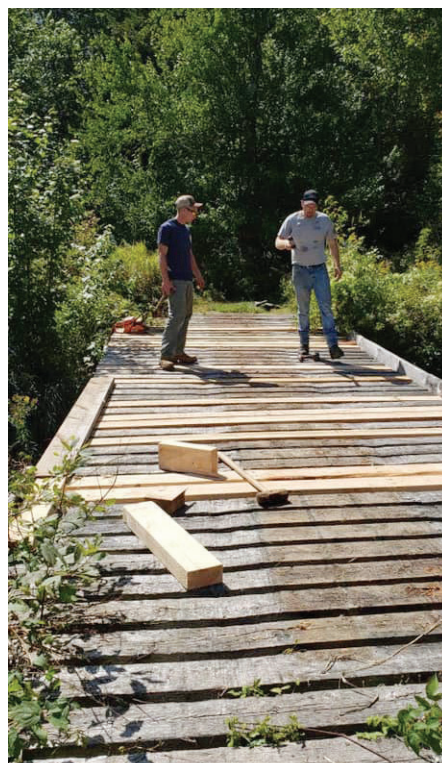
Corridor 90 bridge maintenance