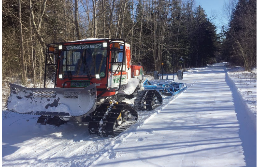
Our Tucker Sno-Cat in October Mountain State Forest

Experience the excitement of snowmobiling the Berkshires. Our Facebook page contains club scheduled events and grooming reports for October Mountain State Forest, Pittsfield State Forest and the Windsor Area. See you on the trails!