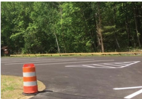
New OHV parking lot off of Route 20 just before the New York State Line