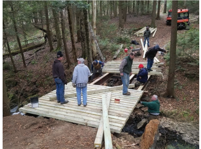
Dedicated trail crew redecking one of our many bridges.

If you've never ridden one of our trails, you're missing out. We have over 75 miles ranging from old town roads, logging trails and narrow sidewinders. Our fleet of 4 large groomers including 3 LMC1800s and a Tucker 2000 keeps the big trails flat and fast while our three groomer sleds (including two Bear Cats and a Scandic) make the tighter trails flat and fun. Our two trail-side local business would love your support. The Savoy Hallow General Store and the Pub 116 offer food and supplies and are compliant with all Covid restrictions.