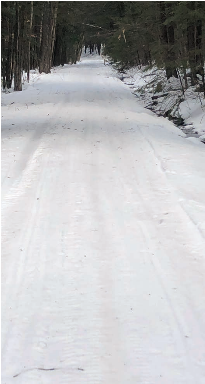
A freshly groomed stretch of corridor 9 through the DAR state forest last season.

Trail passes are available at Spruce Corner Restaurant, as well as Goshen General store. For up to date info check out our Facebook page Goshen Highlanders Snowmobile club. #thinksnow!