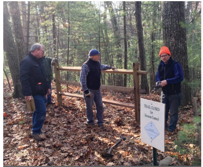
The guys fixing the hillside.

Trail Passes are available in person at Toreku Tractor in Ayer at the rotary. To correspond with the club send emails to harvardsnowmobileclub@gmail.com