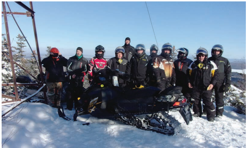
Twelve Easy Riders on the top of the JoMary Lookout Millinocket Trip – Feb 2020

In this strange Covid season the club is celebrating its 50th Anniversary. With Covid limits we are still working on our meeting structure. Our webpage and Facebook group page will be used to keep everyone up to date on our meetings and travel plans