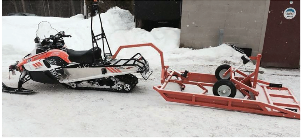
Looking forward to making trails flat!!

Hello all you fellow sled heads. Here we are ramping up for what hopefully will be a very snowy winter season. This has been a very “interesting” year with all of the COVID issues, but the Bullets are doing our best to make sure trails are open and groomed and we hope to have the clubhouse open on the weekends once snow falls. We are staying with tradition and hosting a “Drive Thru/Pick Up” holiday dinner on Dec. 5th. Reach out to a board member or thru Facebook for tickets. We have been hustling to take care of trail work and bridge repair work and can always use help with those tasks. We have memberships & SAM passes available at the clubhouse and at Valley Motorsports, and have also mailed out newslet-