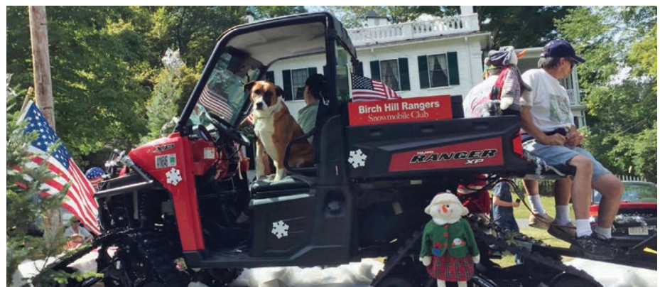
Groomer at Royalston Parade

We groom our trails with a red Polaris Ranger. Our trail system is in the town of Royalston and can be accessed through Lake Dennison maintained by the Coldbrook Snowmobile club. Be on the look out for it during the week, especially after a snowfall. Our groomer operators are just