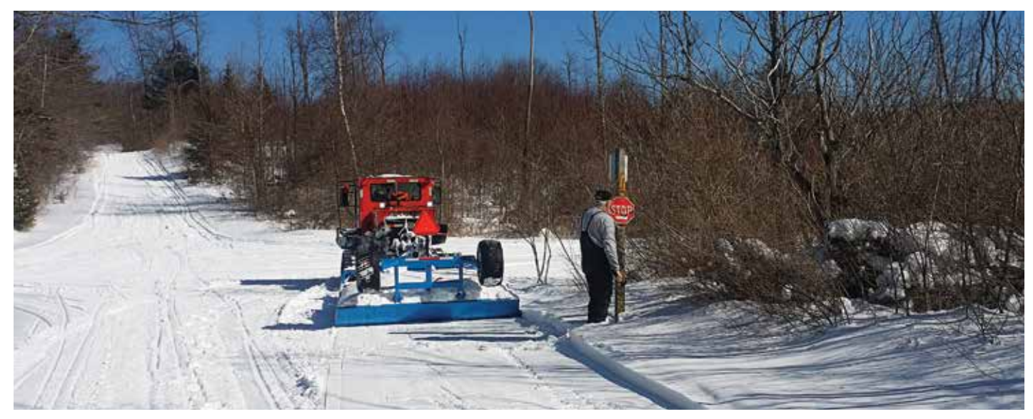
The Berkshire Snow Seekers' crew tends to signs while grooming the trails.