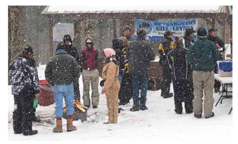
Bernardston-Gill-Leyden members gather round the fire pit during a festive outdoor BBQ. Something about a snow squall makes the burgers taste better.

We would like to share with you some information about our annual Christmas Party (December 12th). As we discussed our annual party we had several goals in mind: 1) keep it local, 2) keep it inexpensive, and 3) have the focus be on food, friends, and charity. What we have done the past few years is to move away from a general "toys for kids" type charity to a process where we identify local individuals or families in need of support. A large portion of our October and November Club meetings was devoted to discussion surrounding charities and the need for our support. A short time ago we developed a short "Charity Form" that we use in our selection of the charity we will support. We would like to remind other clubs of the importance of being an active club in terms of community involvement and providing support for various charities. On many occasions we spend more time discussing our involvement with charities than trails. We would also invite anyone reading this to join us at one of our club meetings be a part of our discussions. http://adamssnodrifters. webstarts.com.