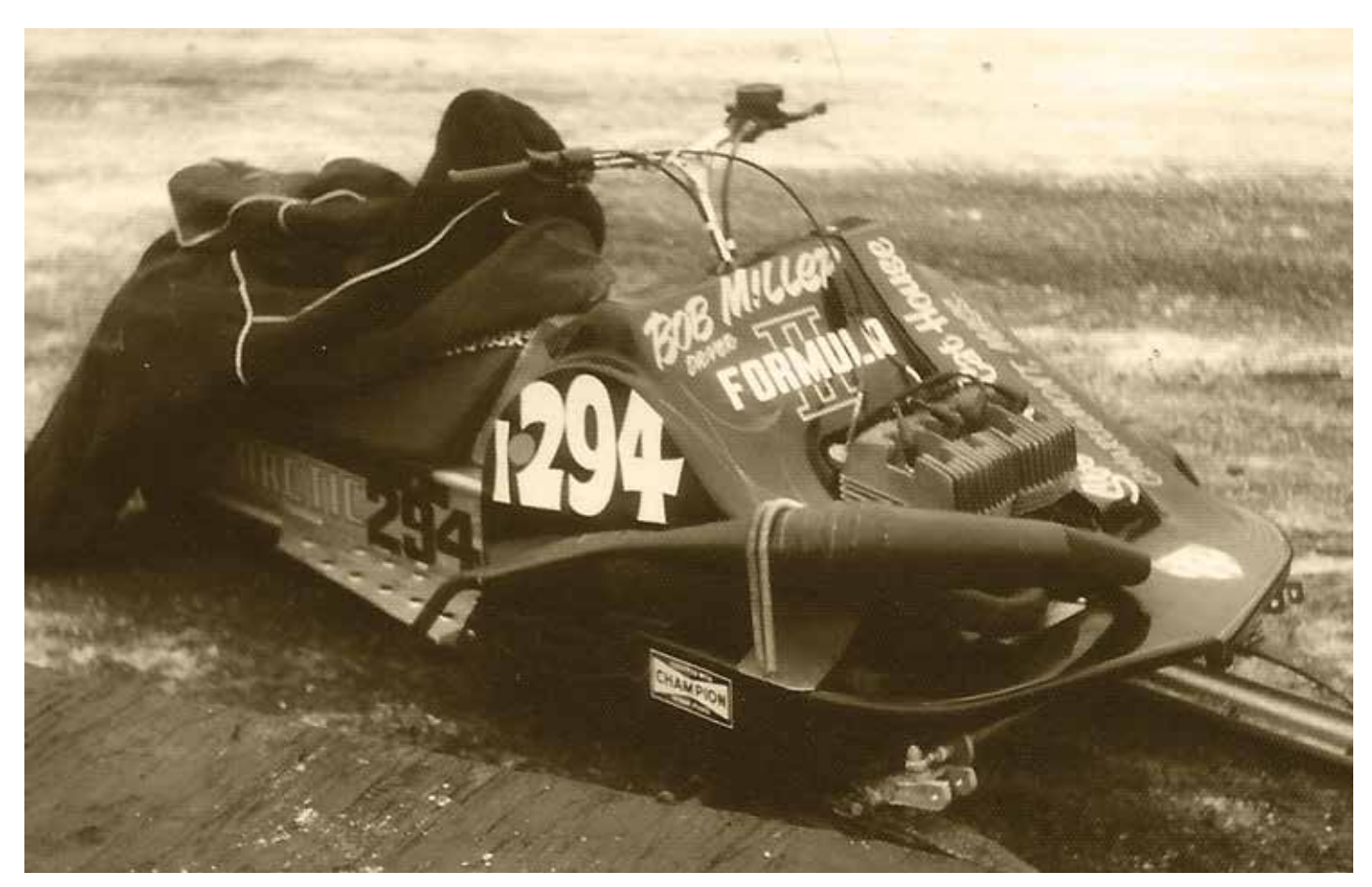
Our 1973 Arctic Cat Formula II ready for the 1972-73 season. Only 50 of these special sleds were built.