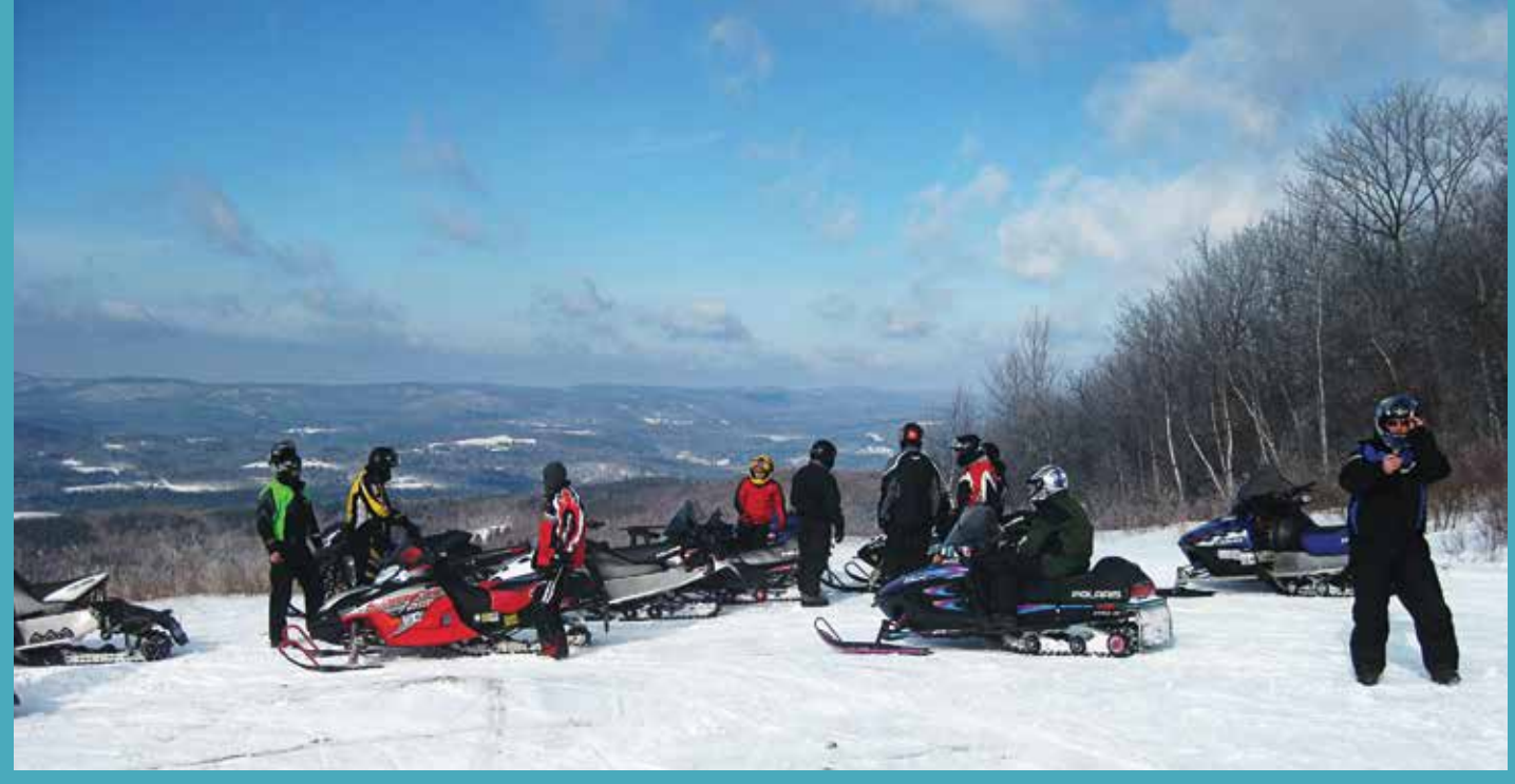
The Berkshire Snow Seekers club-ride to Pontoosuc Lake took them to a impressive look-out.