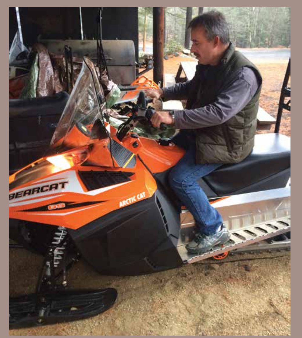
Chesterfield's new grooming sled is ready to smooth trails this winter.