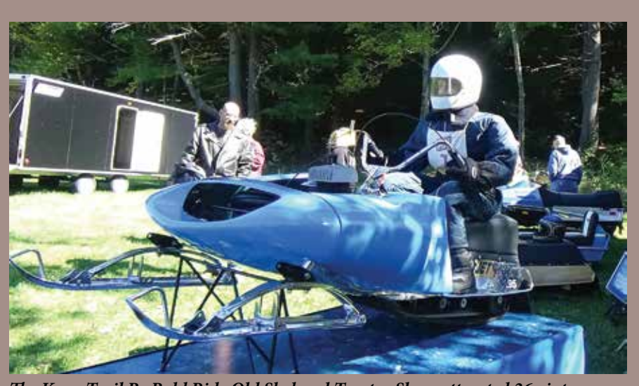
The Knox Trail Be Bold Ride Old Sled and Tractor Show attracted 36 vintage snowmobiles and 18 vintage tractors.