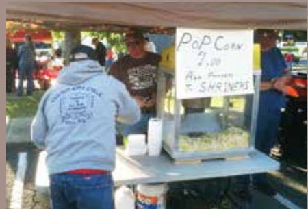
The Adams Sno Drifters raised a significant amount of money for the Shriners through the sale of popcorn at Bike Night.