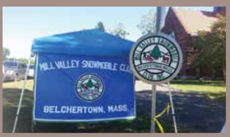
The Mill Valley Club made their presence known at the Belchertown Fair, where they parked cars as a fundraiser.