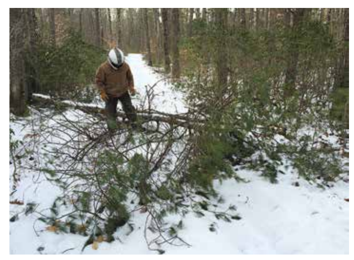
Watch out Rick! The Porcupine Ridge Runners remind you to always be on the lookout for downed trees and other obstacles on the trail.

As always, volunteers are needed for trail work, groomer maintenance and operation, club events, etc. Would you like to help? Call the Sno-Phone, go to knoxtrail.com, write to KTSR, Box 363, East Otis, MA 01029, visit us at an event, or attend a meeting! See you on the trails!