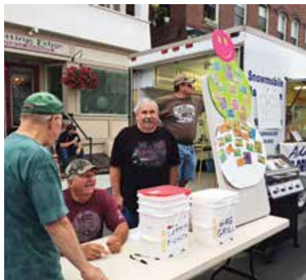
Adams members distributed free popcorn and snowmobiling literature at the Adams Street Fair.