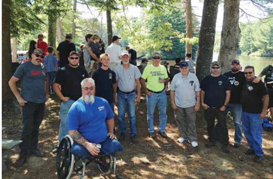
Members of the Easy Riders Snowmobile Club attend the annual water-skis in Union CT. Held every year for at least the last 25 years on the first Sunday in July and August. A club tradition that we try not to miss.

does, the Easy Riders will be ready with planned trips to our usual locations throughout Mass, Maine, New Hampshire and Canada. As a traveling club, we offer many different options for destinations to travel, and different riding styles.