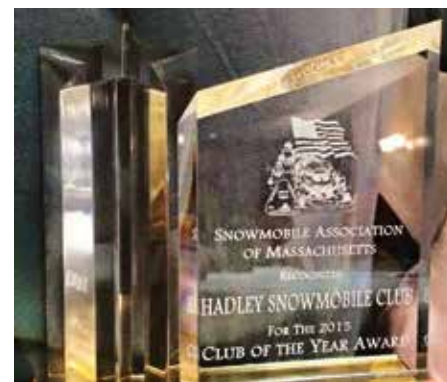
The Hadley Snowmobile Club is happier than a puppy in the snow after taking home the coveted 2015 Snowmobile Club of the Year Award.

We are really looking forward to another productive and fun-filled season. Whether it's trail preparation, the Sled Expo, events, meetings, or just riding