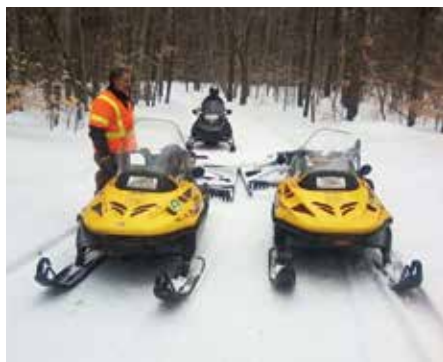
The grooming crew of the Porcupine Ridge Runners take care of the club trails.

Our meetings continue to be held the second Monday of each month at 7pm at the Shutesbury Athletic Club. Please join us at a meeting and look forward to seeing you on the trails!