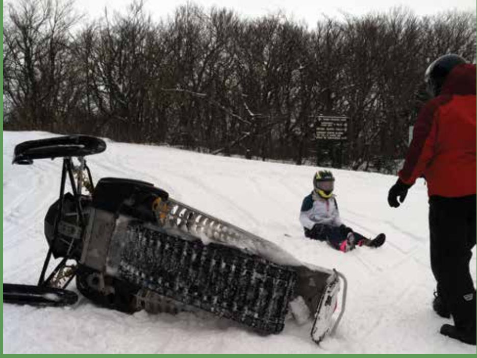
Novice Rider, Daytime, Perfect Trail Conditions, Speed approx.15 mph, cause: ICE