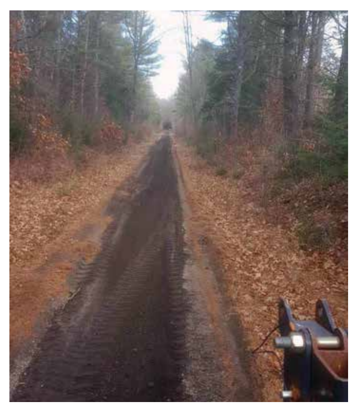
ITS 71 has been cleared, brushed, and graded.

We hope the snow continues to fly and everyone has a safe season.