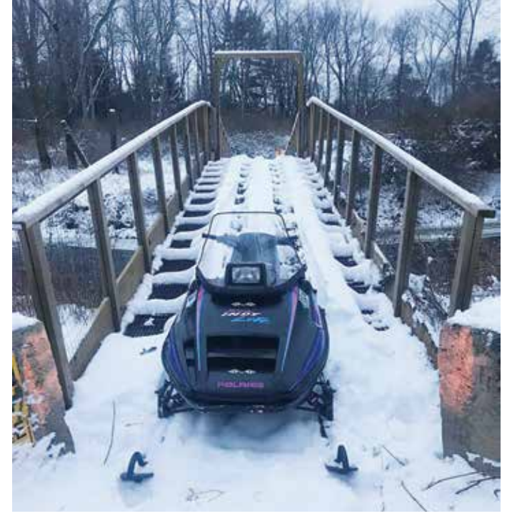
First tracks of the 2017-18 season over the Coldbrook seasonal bridge.