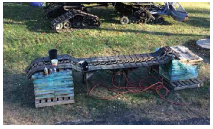
Replacing a track on one of the Coldbrook's Tucker Sno-cats.