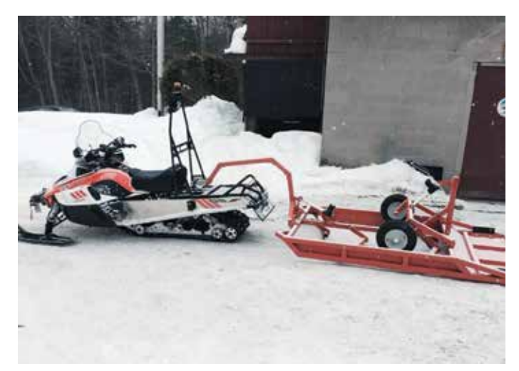
Burgy Bullets are ready to flatten some trails!!

brutal cold, ice storms and some snow, our volunteers have been repairing bridges and getting the bugs out of our groomers. With this light snow, I see lots of clubs struggling with those snowmobilers who feel they are above the rules. I wonder if they usually