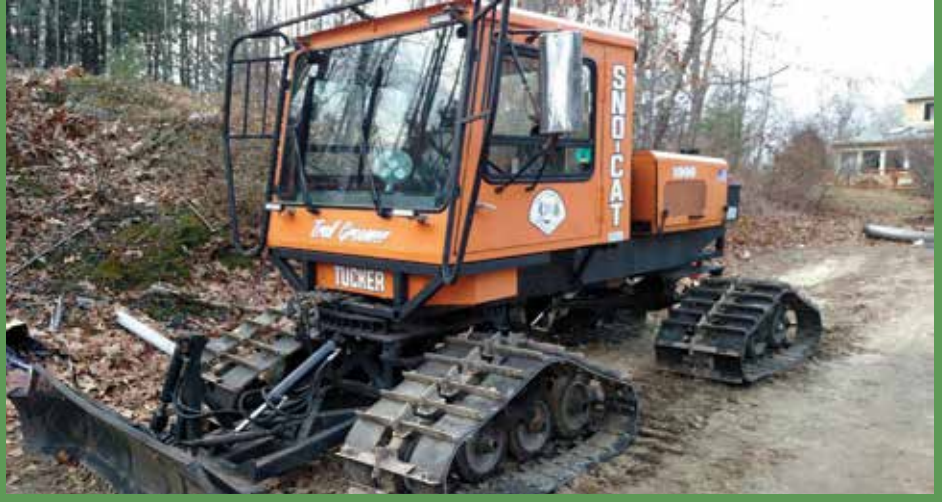
Hopefully snow is arriving soon for the groomer