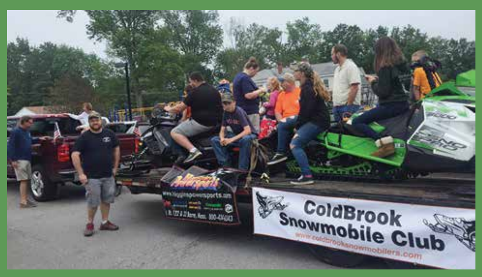
Some of our volunteers on the float we put together for the Hubbardston, MA 250th parade. Special thanks to Higgins Powersports for allowing us to use some brand new sleds!