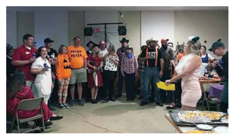
2017 Halloween Party at the Chesterfield Four Seasons club house.